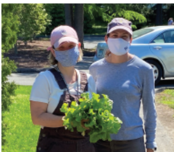
The Unity Garden's first harvest of the season!

We look forward to a bounty of fresh produce this season, including lettuces, kale, swiss chard, beets, peas, potatoes, cucumbers, beans, and eggplant.