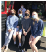
Darien Youth Commission hosted a drive-thru food drive