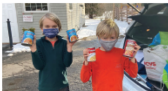
Students from Tokanaka School donate to P2P's Souper Bowl Food Drive

P2P is providing more food than ever before, with a 71% increase in our food assistance program in the first 12 months of the pandemic. This represents more than TWO MILLION MEALS.