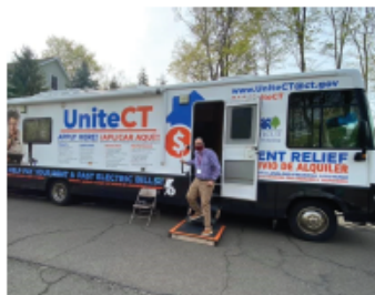
The State of CT's UniteCT bus visited our Darien site to assist qualified CT households financially impacted by COVID-19

Emergency financial assistance increased an astounding 178% in the first 12 months of the pandemic. As the people we serve lost jobs, experienced reduced hours, or succumbed to COVID themselves, making their rent payments became more and more difficult. In the first 12 months following the start of the pandemic, P2P issued $1,043,897 in emergency financial assistance, mostly for rent, to help keep families safely housed during this crisis.