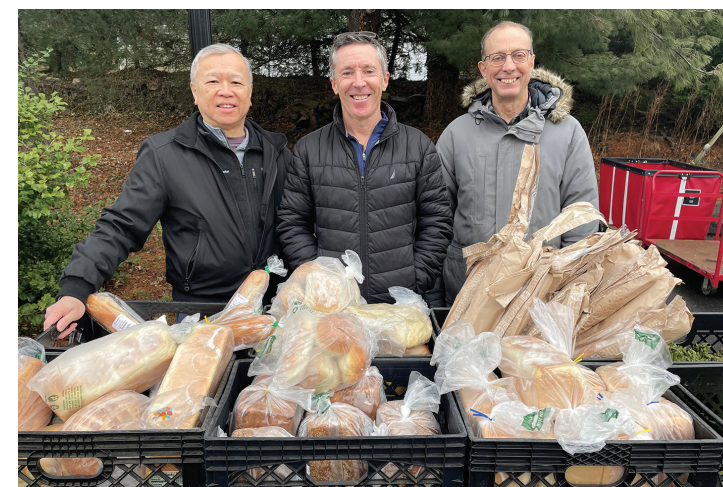
P2P volunteers deliver bread from Cobs Bread.