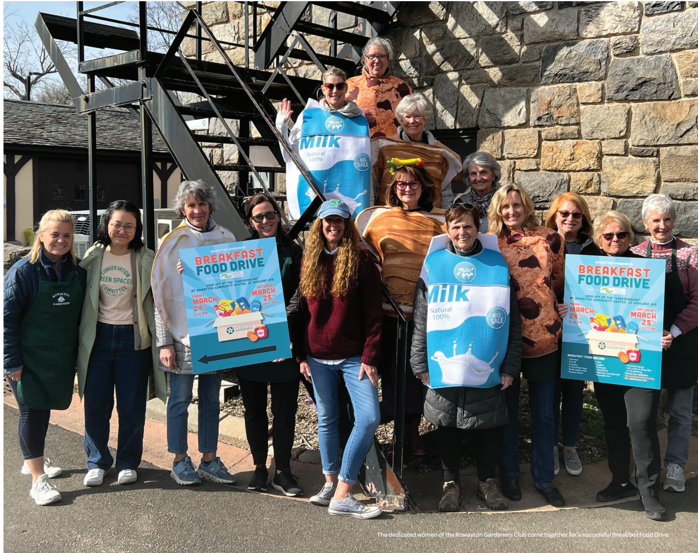
The dedicated women of the Rowayton Gardeners Club come together for a successful Breakfast Food Drive.