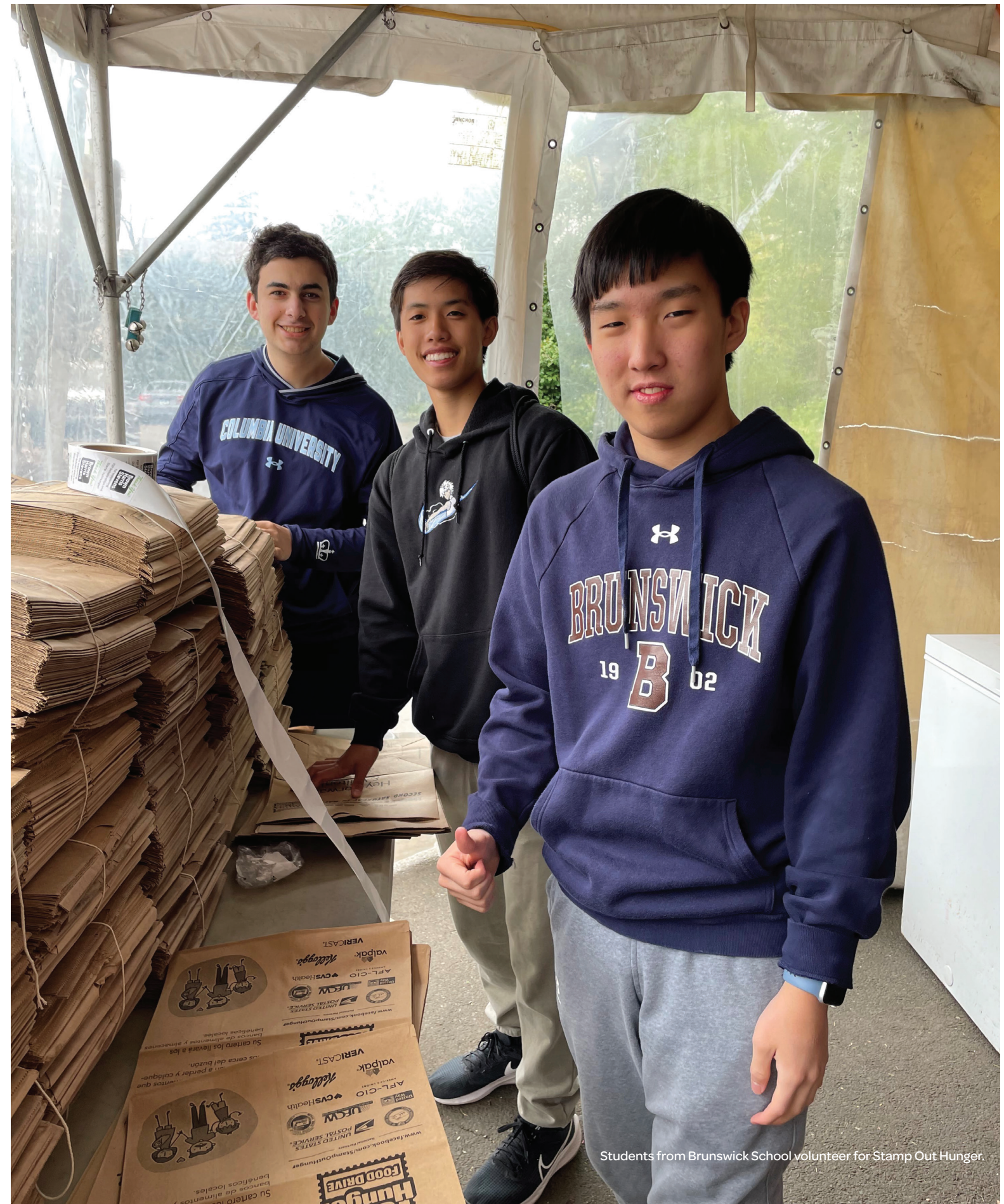
Students from Brunswick School volunteer for Stamp Out Hunger.