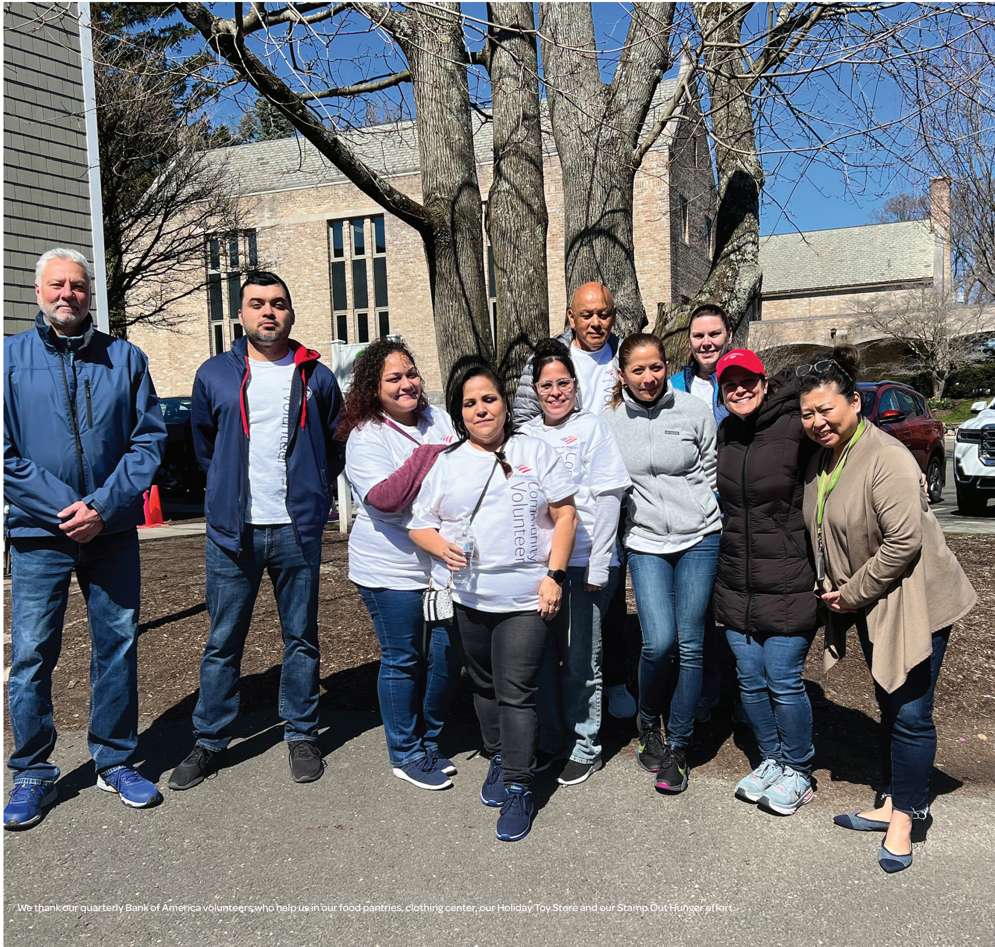
We thank our quarterly Bank of America volunteers who help us in our food pantries, clothing center, our Holiday Toy Store and our Stamp Out Hunger effort.