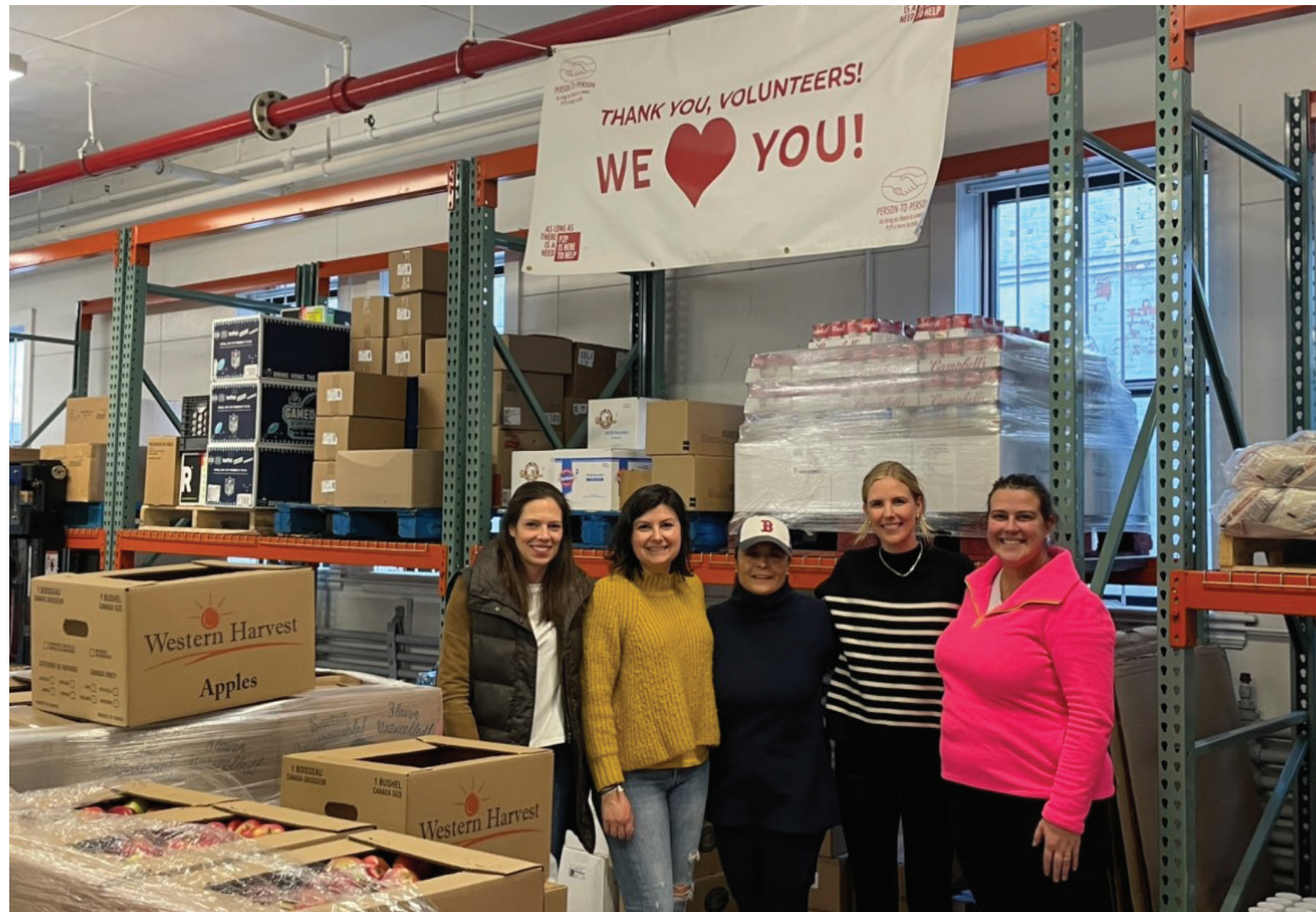
OPUS members volunteer at our Stamford Warehouse.

In FY 2023, OPUS raised $177,000 through a variety of fundraising initiatives, including the annual OPUS Runs for the Roses Kentucky Derby party, very popular Santa Claus for a Cause event, and Fun on the Farm.