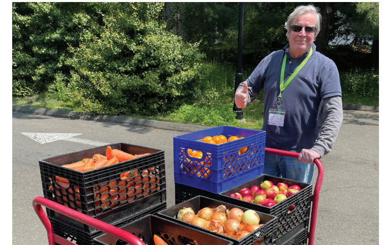
A volunteer delivers fresh fruit and vegetables.