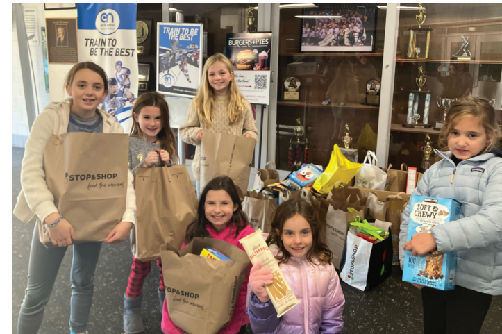
Girl Scouts hold a food drive.