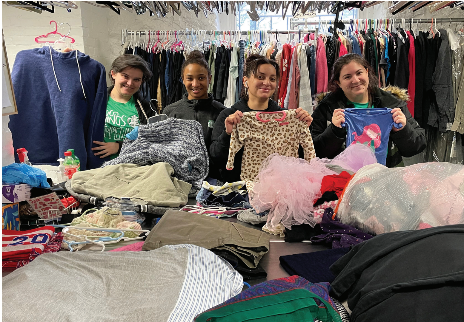
Volunteers from Starbucks sort clothing donations.