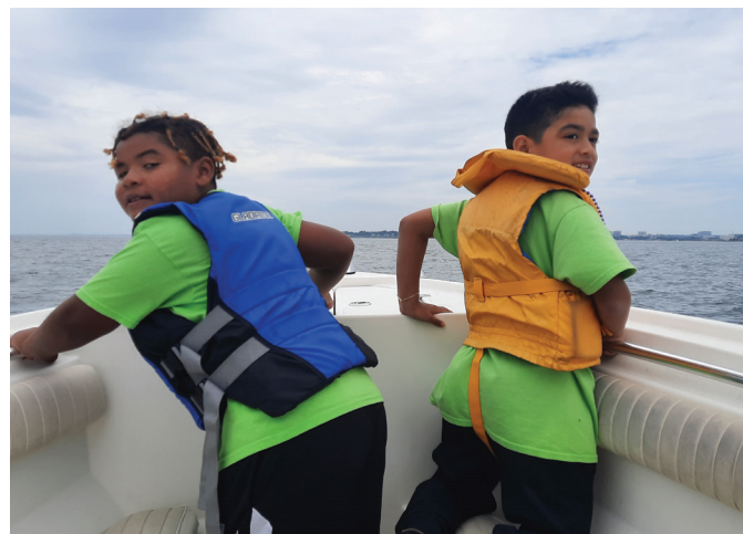
During the annual "Boat Day," members of Noroton Yacht Club and Darien Sail and Power Squadron take campers and counselors out for a day on Long Island Sound. Despite living in such close proximity to the Sound, for many campers, it is their first time on a boat.

When children have access to a fun and joyful summer camp experience, their parents can have peace of mind knowing that while they're at work, their children are in a safe, enriching environment. P2P's campership program has served 3,818 children since 2014.