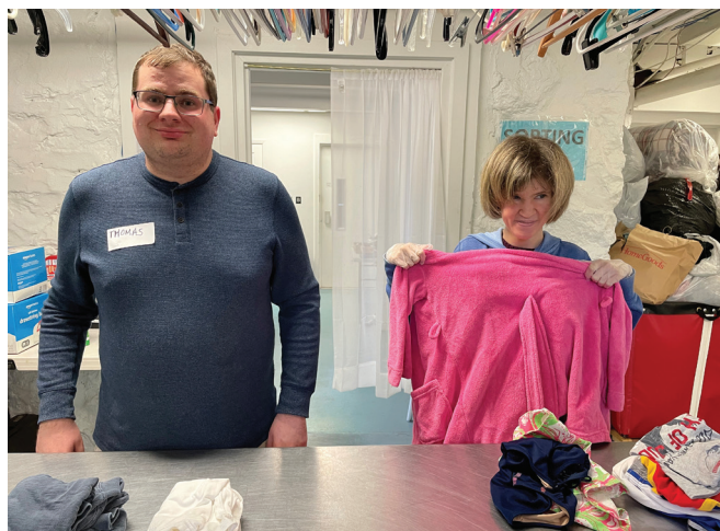
Volunteers from STAR, Inc. sort clothing donations.

We extend our heartfelt thanks to the thousands of volunteers who rise above and beyond to serve others through P2P.