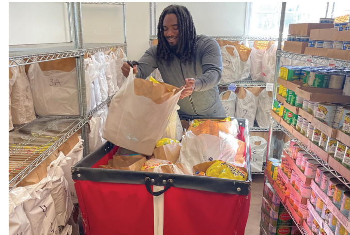
A staff member prepares bags of food for curbside pick-up.