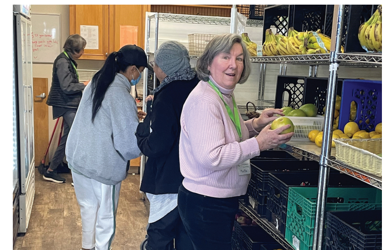
A volunteer stocks shelves in the Norwalk pantry.