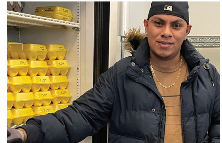
A volunteer stocks eggs in Darien.