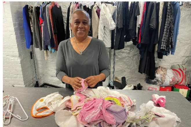
Volunteer sorts clothing donations